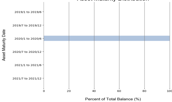
Asset Maturity Distribution

There is one single asset in the pool with the maturity date in June 2020.